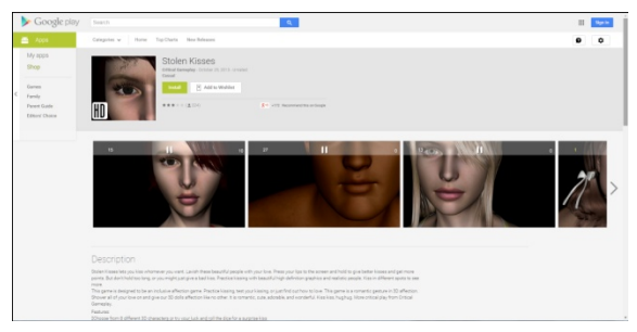
Fig 1. Stolen Kisses , 2015, Lindsay Grace, digital game .apk, Copyright owned by Lindsay Grace.

After studying the affection games genre it was clear that several characteristics plagued the space. In particular, the games demonstrated very little racial or gender diversity. Stolen Kisses was designed to test the international market for a game that offered increased racial and gender diversity. The simple game was developed and released by the artists-researcher on October 25, 2013. The game, as listed on Google Play in 2015 is shown in figure 1.