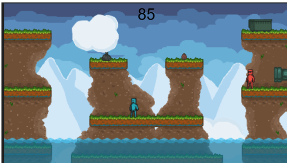
Figure 2: The main gameplay of Rising Tide.

Rising Tide was made using Construct 2 [11] for development and Photoshop for image creation, by a team of 1 developer, 1 designer and 2 artists. All but one of its members had experience making games in the past. The game's developer had participated in 3 prior game jams.