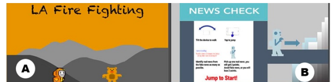
Figure 4: LA Firefighting game in (A) and Newscheck in (B)

I Am A Bot was created by two people using Twine [12]. Neither of the two people had ever used Twine previously. They both had limited experience with Photoshop. In Newscheck, shown in Figure 4, players navigate a platformer, avoiding fake news and collecting real news. Newscheck was made by a team of 4 who had limited Photoshop experience and no experience making games previously. In LA Firefighting, also shown in figure 4, players must extinguish fires while saving citizens and animals. LA Firefighting was made by using GameSalad [13] by a team of three participants that had no prior game-making experience. Images were made using Photoshop.