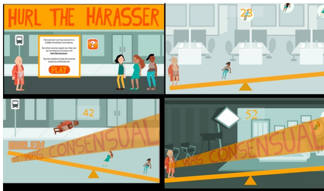
Figure 5: The Hurl the Harasser Game

The hosts also developed a game based on the increasing number of sexual harassment allegations being made about celebrities. In the game, players had to help non-player characters speak by tapping them. Enough taps released the character from a bubble and allowed them to fall on a scale counter-balanced by the harasser. If the player popped enough bubbles then the harasser would be hurled from the scene and a new level would load. It was based on the metaphor that if enough sexually harassed people speak they can tip the balance of justice. The game, called Hurl the Harasser, is shown in figure 5. The game was created using GameSalad for game development and Adobe Illustrator for images. Three people contributed to the creation of the game.